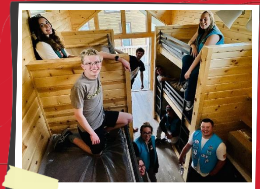
10 Bunkhouse Cabins

One (1) Cabin that is a mini home can be used for program leaders. Cabin sleeps up to seven (7) people.